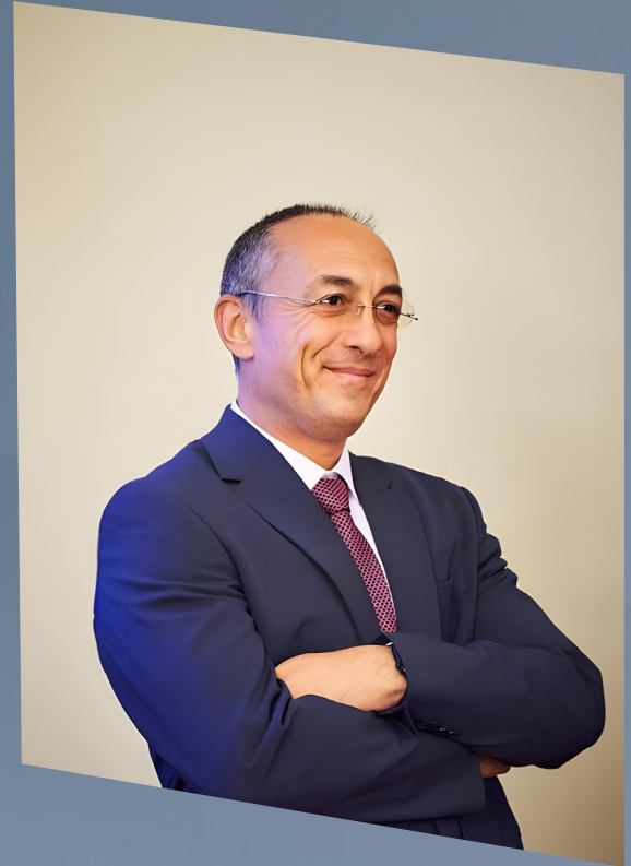
Hon. Francesco Depasquale - Judge of the Maltese Courts, President of the Council of Europe Commission for the Efficiency of Justice (CEPEJ), President of the Association of the Maltese Judiciary

Ultimately, justice must be delivered within a reasonable timeframe, and mediation should be regarded as a valuable tool in achieving this objective.