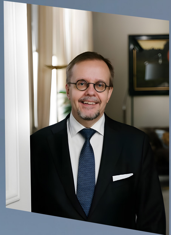
Hon. Dr. Tatu Leppänen - President of the Supreme Court of Finland

Judge in Court of Appeal and District Court 2010-2014. Chief Judge in District Court 2014-2016. Justice of the Supreme Court 2016-2019. President of the Supreme Court from 1 September 2019. Member of the Permanent Court of Arbitration 2022.